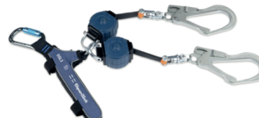
Twin Dynamic Self-Retracting Lanyard - DSL3

Prioritise your workforces' safety with the NEW DSL3 Fall Arrest lanyard.