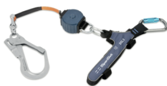
Single Dynamic Self-Retracting Lanyard - DSL3