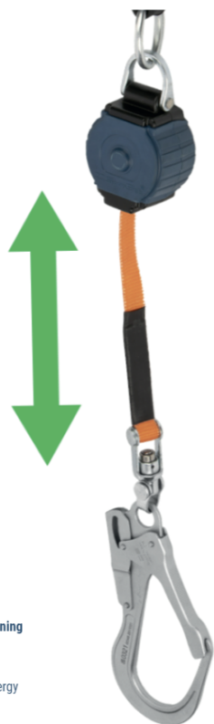
Auto shortening lanyard with a fully certified energy absorber