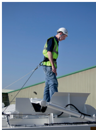
STOPPA Vehicle Fall Protection Systems