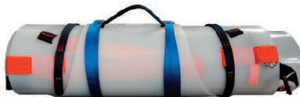
Rolled Stretcher with sewn carry handle