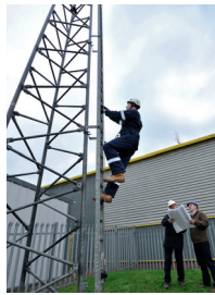
Safety Management Inspections, Servicing and Training