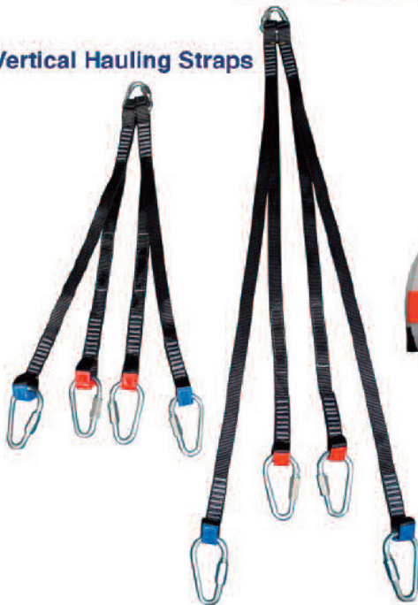
Vertical Hauling Straps